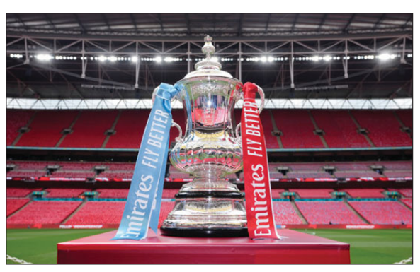
Wycombe are in the FA Cup fourth round

The previous three encounters have all taken place at Adams Park, with North End winning two and Wanderers winning one.