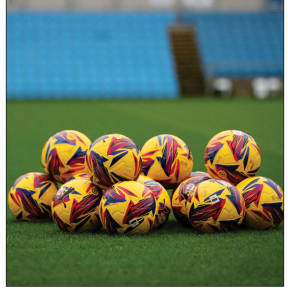
A big win for Wycombe Wanderers Women.

The win sends the Chairgirls up to second in the league table with 23 points, as third place Portchester follow closely behind on 22 points with a game in hand. The Wanderers now take on Penn & Tylers Green Ladies in the rescheduled quarter final of the Berks & Bucks County Cup.