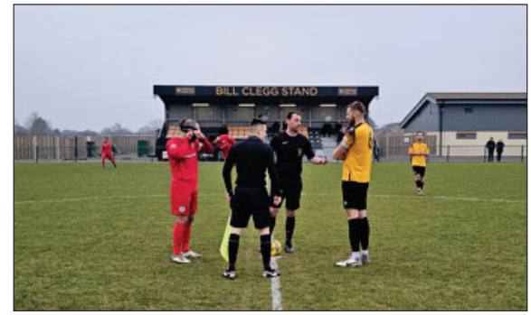
Beaconsfield Town edged Stotfold on Saturday.