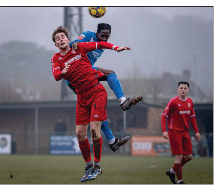
Flackwell Heath compete for the ball in the air.

ior Cup tie at Binfield was postponed due to a waterlogged pitch, rescheduled for February 25.