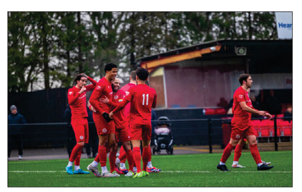
Beaconsfield celebrate their second goal.

Beaconsfield travel to North Leigh tomorrow looking to continue their fine run of five unbeaten.