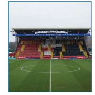
Sincil Bank