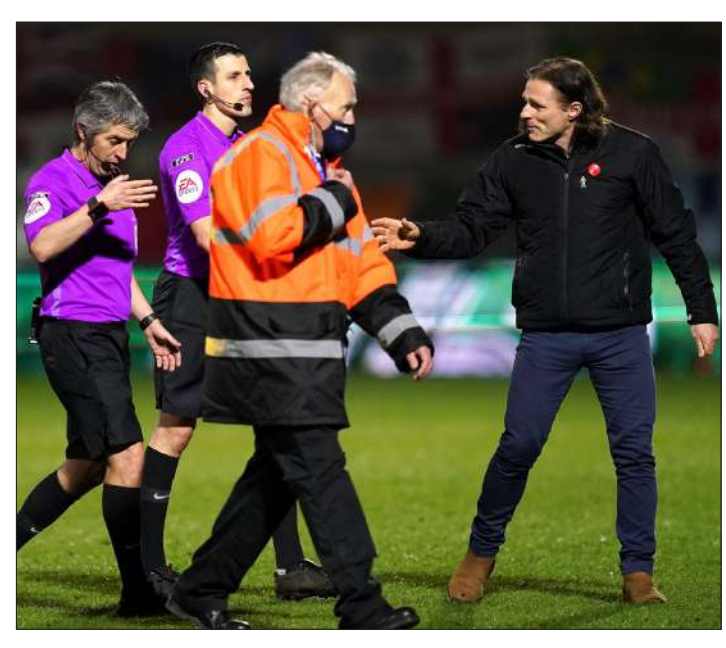
Wycombe Wanderers manager revealed the good news after the 0-0 draw at home to Shrewsbury Town on Tuesday, February 8