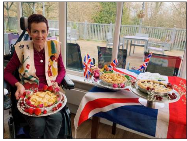
The delicious pies

Their fabulous puddings are a Trio of Pies, called 'Long May she Reign!' which consists of an apple and elderflower pie decorated with pastry hearts, plaits and twists surrounded by strawberries and roses, a black cherry pie decorated with a pastry crown and glacier cherries and a strawberries and cream pie.