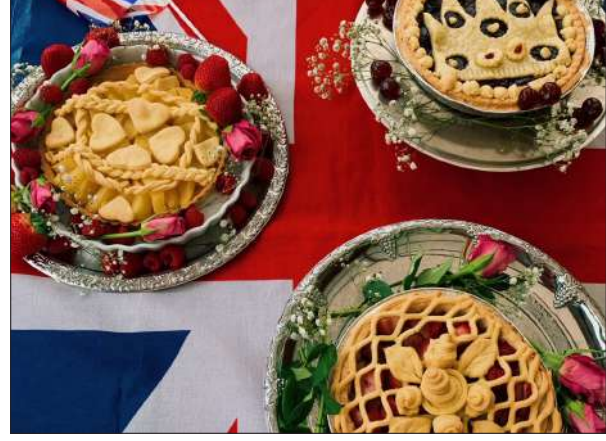
A lot of time and effort went into the design and baking process