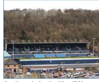
Another win for the Wyc (PA)