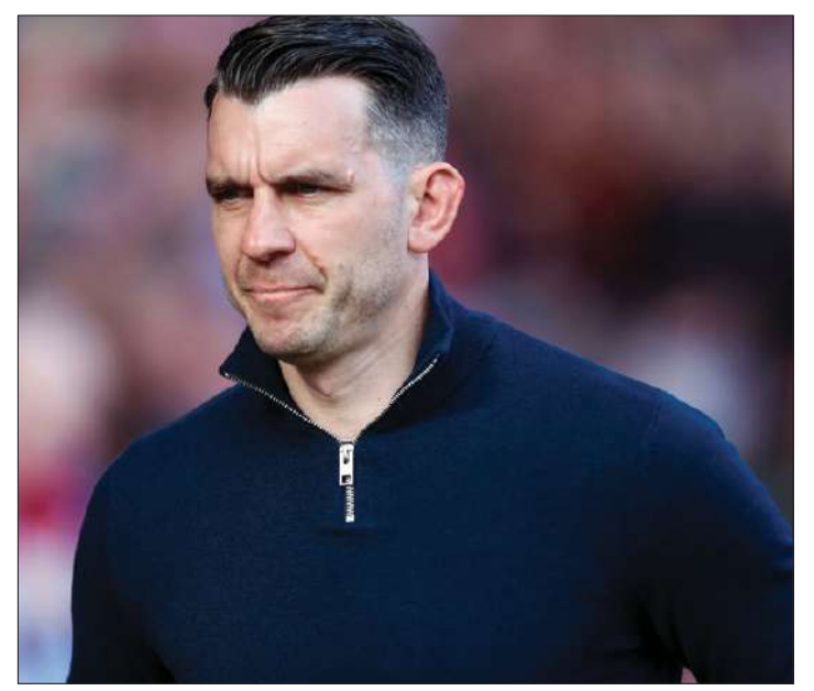
Matt Bloomfield's side have won the last three games without conceding a goal