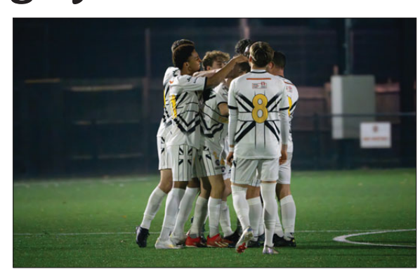
Windsor celebrate victory.

Windsor travel to Penn and Tylers Green on Saturday (3pm ko).