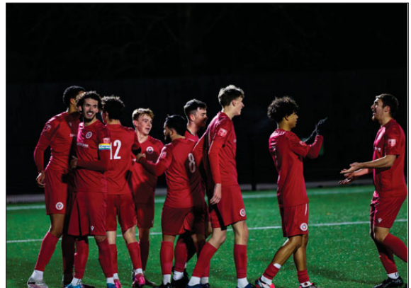
Beaconsfield celebrating the winner.

Beaconsfield return to league action tomorrow with a tough test at Holloways Park when they face Real Bedford.