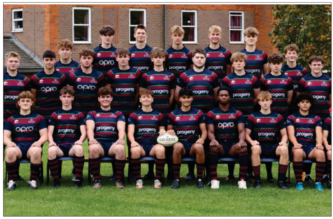
Royal Grammar School, Wycombe

"Whenever you get to these rounds it's always going to be a tight contest so sometimes it's a bounce of the ball, a referee