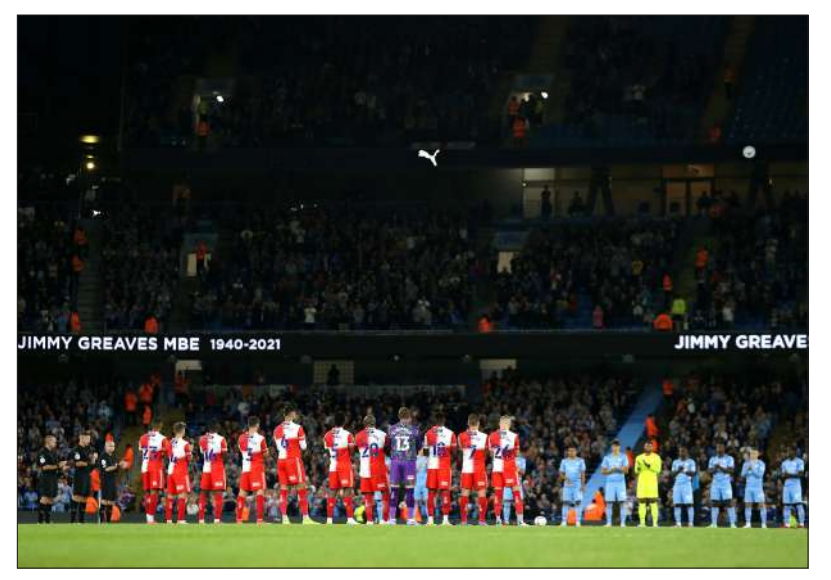
The late Jimmy Greaves was remembered before the match kicked-off at the Etihad

Here is a selection of photos from Wycombe's trip to the Etihad Stadium.