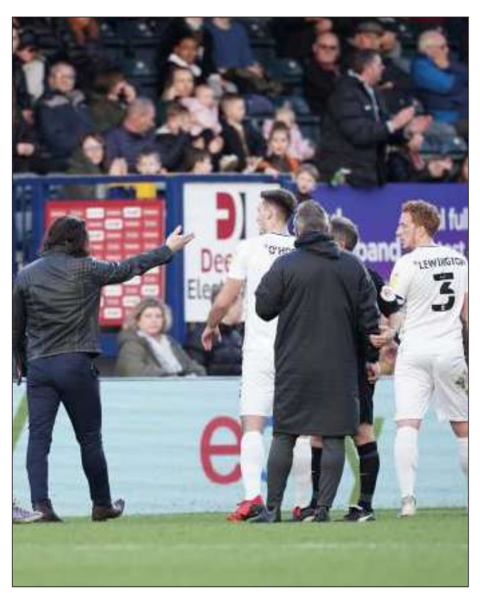
Wycombe boss Gareth Ainsworth asked the MK fans to stop singing the slanderous chant at Adebayo Akinfenwa on Saturday, January 29

THE EFL has issued a statement in the face of the growing amount of 'unacceptable' antisocial behaviour in games across the country.