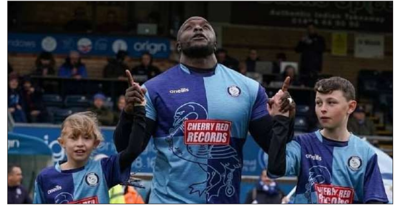
Two mascots with Bayo at match at Adams Park (Lauz Galloway)