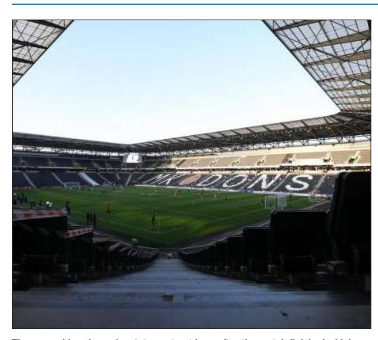
The away side released a statement not long after the match finished which saw them win 1-0. They play their home games at Stadium: MK