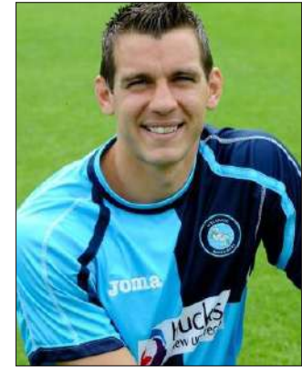
Blooms in the 2009-11 home kit