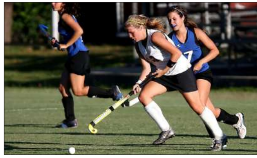
How did Marlow do last week?

The fifth team beat Newbury and Thatcham 3-1 away, the sixth team beat Wycombe 2-1 and the seventh team beat Wycombe6 3-0