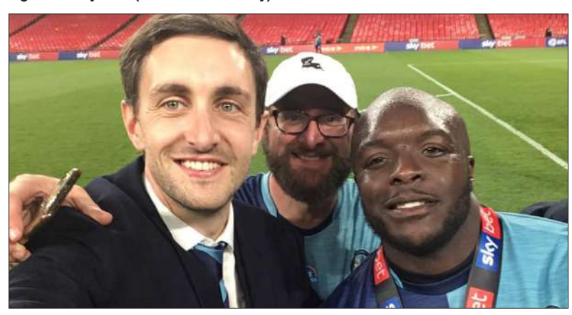
The aftermath from THAT day at Wembley (Matt Cecil)