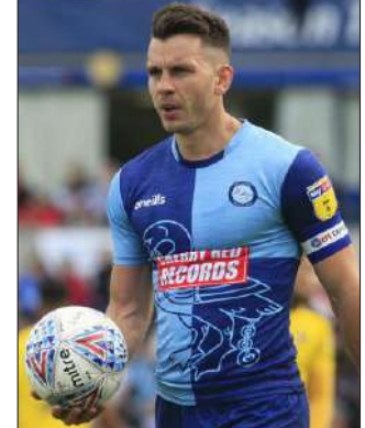
Wanderers' captain