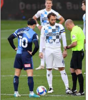
The iconic number 10 shirt