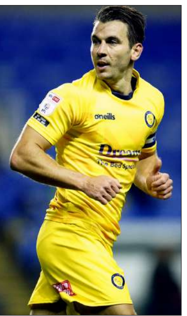
The skipper in action