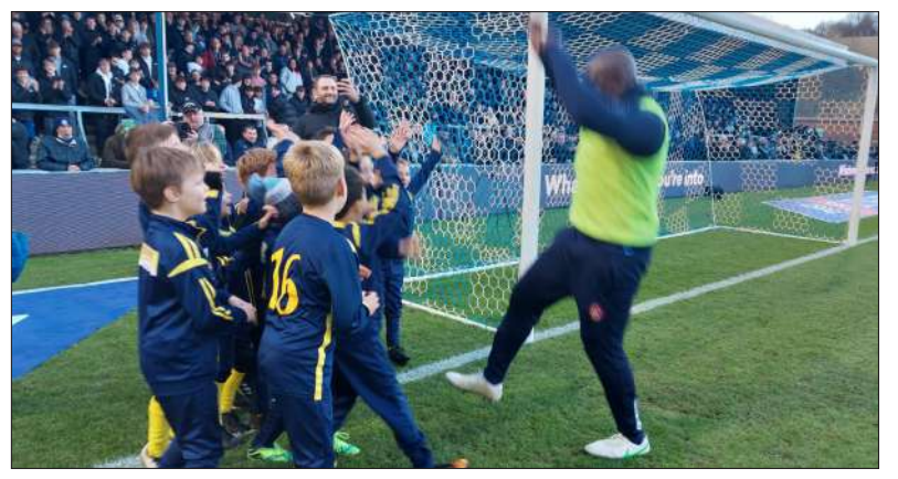
Moments that last a lifetime (WWSET)