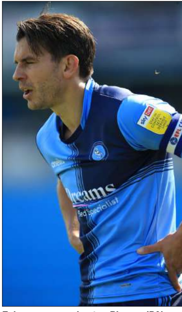
Enjoy your new chapter, Blooms (PA)