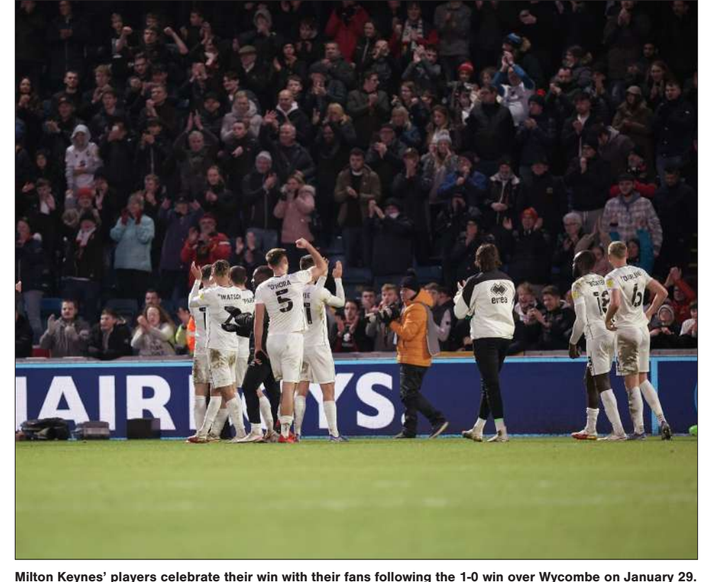
It was the third time this season that the team from North Bucks had defeated Wanderers this season

Urgency was needed from the Chairboys in the second-half if they were going to lift a subdued Adams Park crowd.