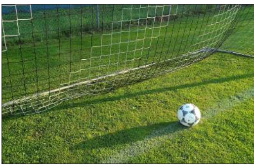
It wasn't the best of days for Wanderers

Next up for the Chairgirls is a home match against Ascot United on Sunday, February 13 which will kick-off at 2pm.