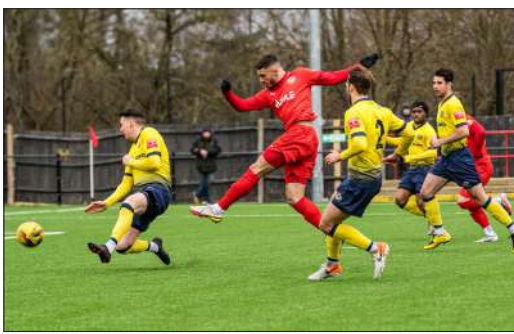
An attacking display

To donate to the charity, go to www.wycombemind.org.uk.