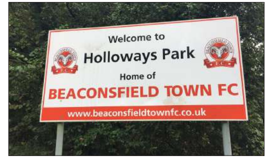
Beaconsfield Town FC play their games at Holloways Park

In order to help the charity, all customers and fans have to do is quote 'BTFC20' to the team of professional will writers online, or mention