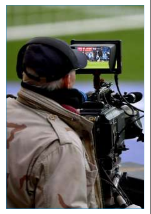
TV camera man at Adams Park