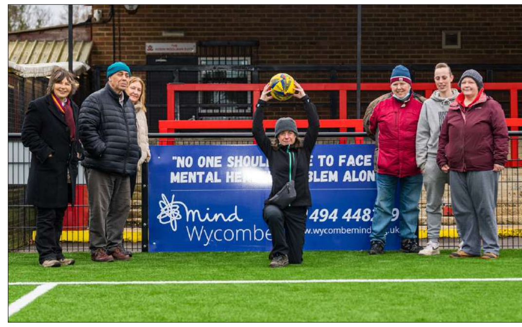
The day was enjoyed by many people as thousands was raised for Mind

"The people who came from Mind where really happy com-