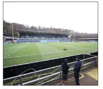
The game will be on March 19

Championship football is in the club's sights, but in the peripheral lingers the doldrums of non-league which they so nearly faced.