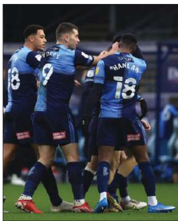
Wycombe (in January 2022) lost 4-1 away at Watford on July 16