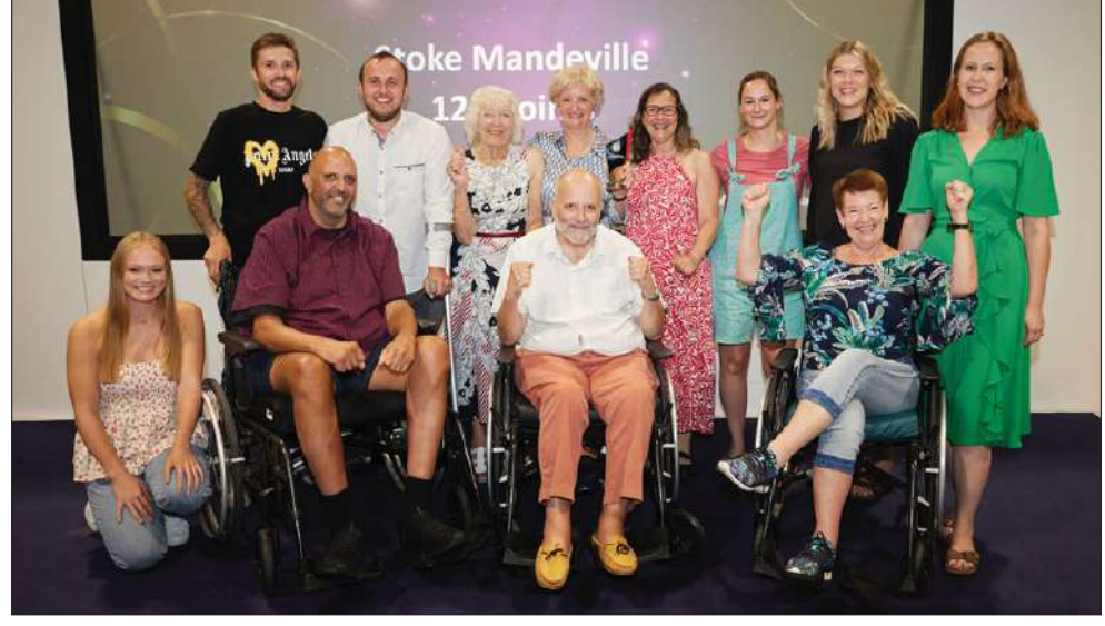
National Spinal Injuries Centre Stoke Mandeville winners

"The tournament exhibited remarkable skills," he stated, "and anticipation builds for its future development.