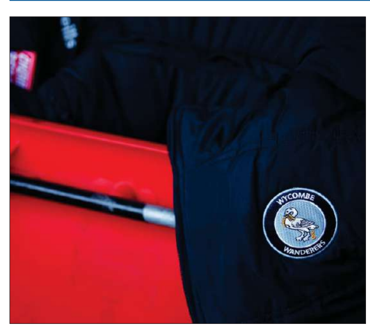
Where will Wycombe finish in 2023/24? This supercomputer believes it'll a top 10 finish Image: PA