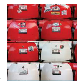
Wycombe take on Lincoln this

WYCOMBE fans wouldn't normally get too excited about winning a first round Carabao cup tie against lower division opposition, but the midweek victory at MK Dons was important for so many reasons.