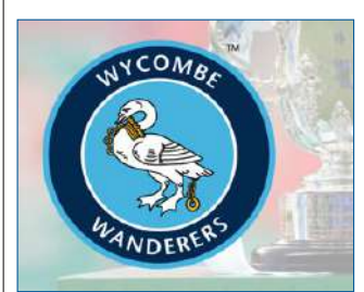
Wycombe will take on Sutton

WYCOMBE Wanderers will take on Sutton United at home in the next round of the League Cup.