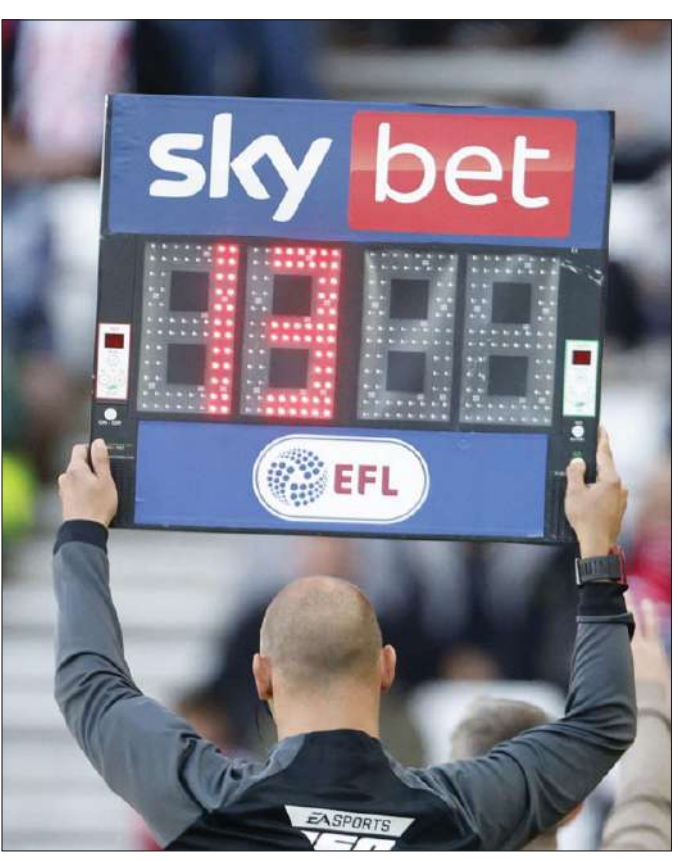
There has been an increase to the amount of minutes being added on at the end of games in the EFL

ROTATIONS to the Wycombe squad will be a common theme this season due to the increasing length of some fixtures across the football pyramid.