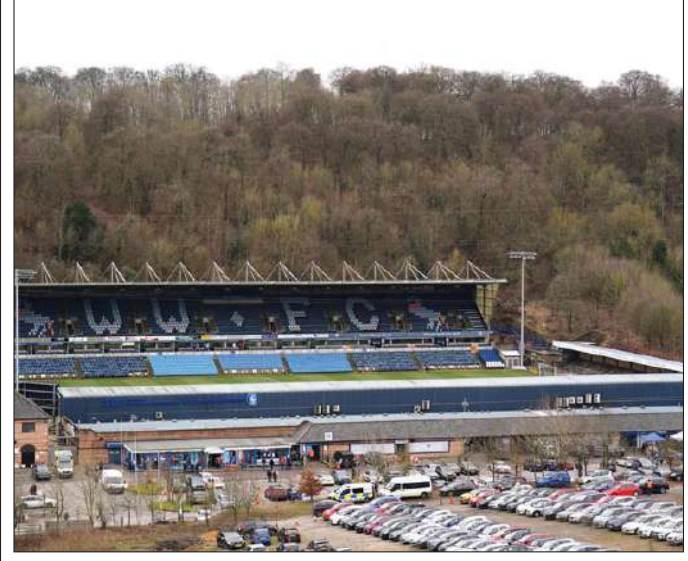
The result means Wycombe remain winless on a Saturday under Matt Bloomfield

To read more about the latest Wycombe Wanderers news which includes reports, interviews and features, go to www. bucksfreepress.co.uk/sport or go to Twitter and follow James Richings at @James BFP.