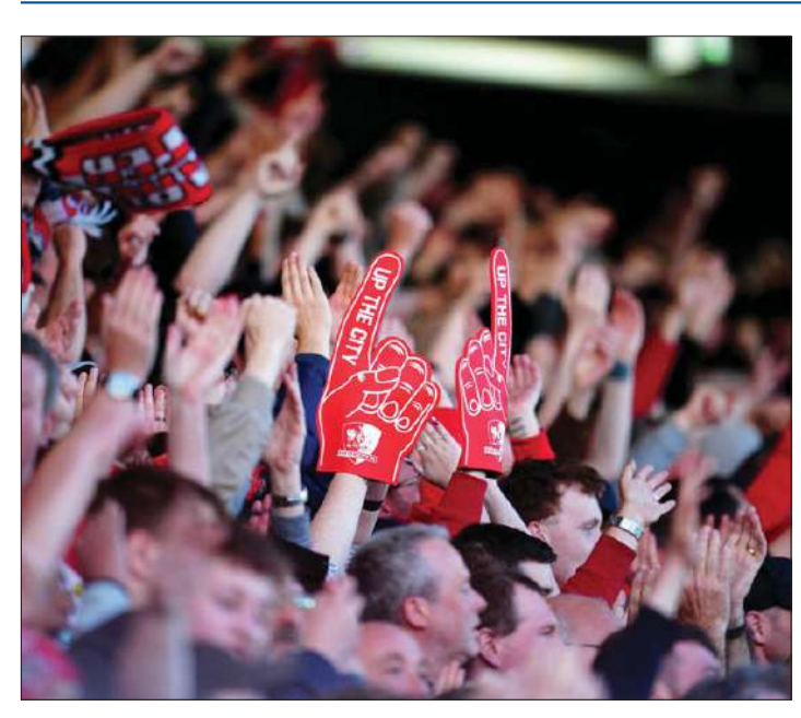
It was nearly a full house at St James Park as Exeter City defeated Wycombe Wanderers 3-1 on August 16