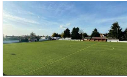
Wilks Park

The first team recently stepped out onto Wilks Park and eased their way into the next round of the FA Cup after beating Keynsham Town