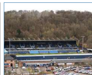
A very busy summer (PA)