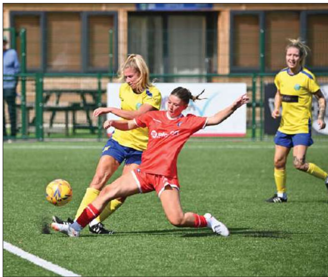
The club named four 17-year-olds on the bench as Wanderers lost 4-1 at Ascot United - the match was also played on a 3G pitch

Finally, on the Big Bash event in the middle of September, he concluded: "There will be live bands, lots of hot food, multiple activities and a motorcycle event."