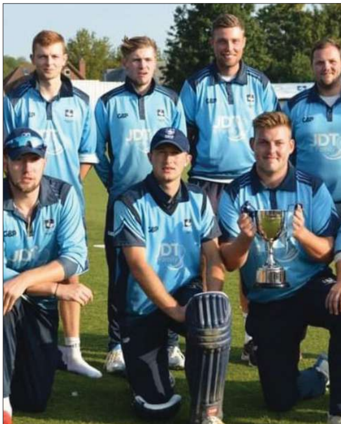
High Wycombe will celebrate their 200th year in business this September

HIGH Wycombe Cricket Club will celebrate a unique milestone this month.