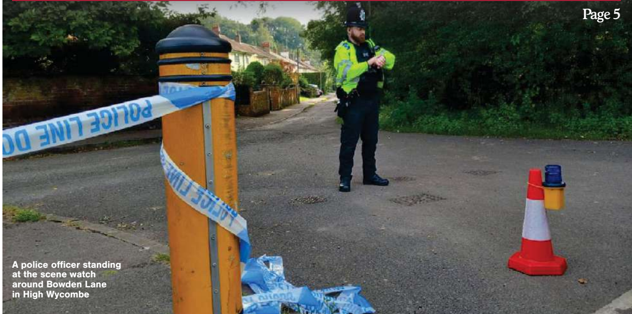
A police officer standing at the scene watch around Bowden Lane in High Wycombe