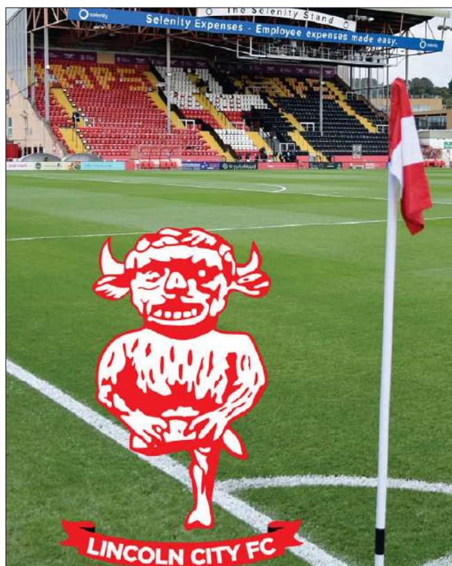
Gareth Ainsworth (not pictured) was happy with Wycombe's point away at Lincoln on December 10

WYCOMBE Wanderers manager Gareth Ainsworth has praised his former club Lincoln City following the recent 0-0 draw between the two clubs at Sincil Bank.