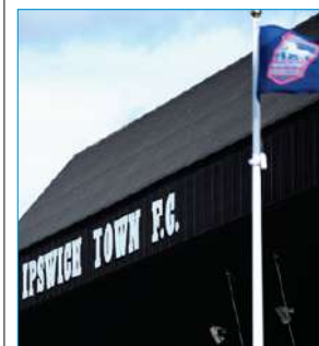
Ipswich Town are in Bucks (PA)

WYCOMBE are about to embark on their toughest month of the season as they face the current top three teams in League One, starting with the visit of leaders Ipswich Town to Adams Park on Saturday, December 17.