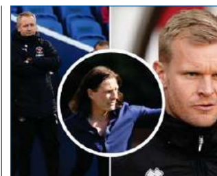
Many changes in the EFL (PA)