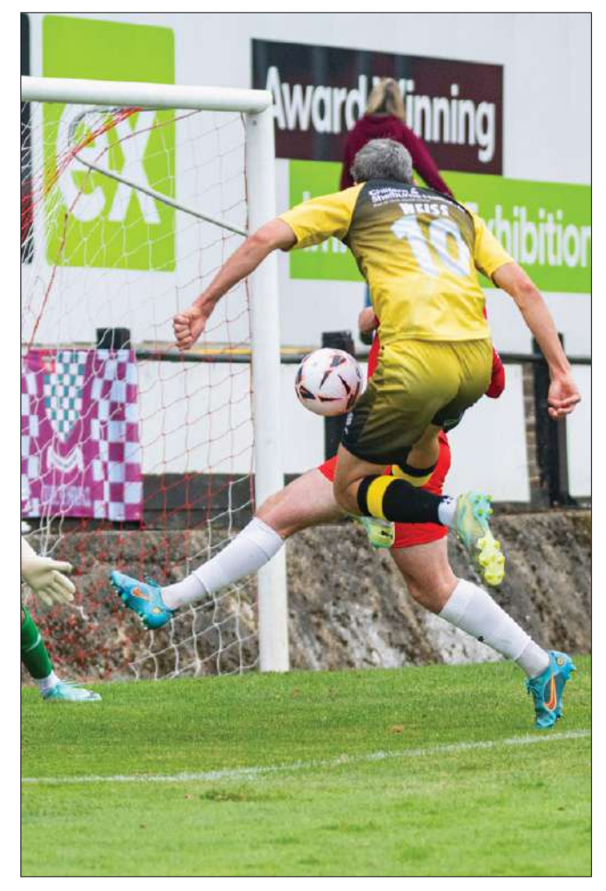
Chesham United were well on top against Welling.

Chesham United FC Women have also started their FA Women's National League campaign. 1 win from 3 and they welcome AFC Sudbury to The Meadow on Sunday (2pm).