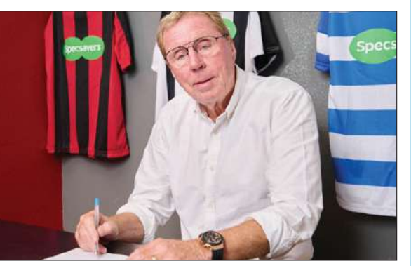
Harry Redknapp was seen the area.

surprises up my sleeve, so let's see who's up for