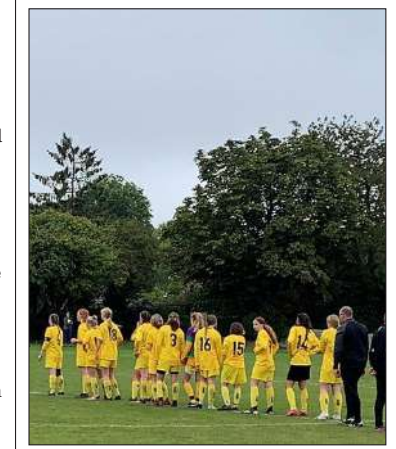
It was another good afternoon of football for Wanderers

The two sides will meet again on October 5 in the Papa John's Trophy.