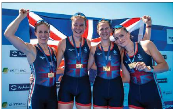
Women's four.

They will bid for gold in the women's four following a heartbreaking fourth-