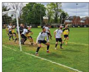
It was goals galore when the Magpies played recently