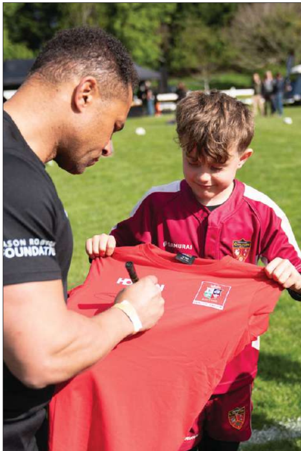
Howden and British & Irish Lions Big Rugby Day Out.

"We want to meet all the Lions Origins clubs and celebrate them, not just because of history but for the future as well," he said.