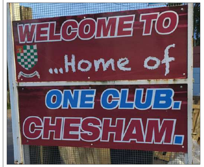
Chesham United play their games at The Meadow within the town, along with Aylesbury United