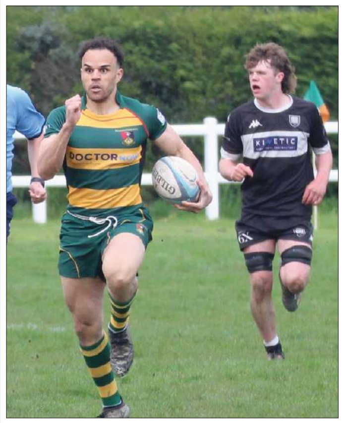
The match took place on April 29 which Beaconsfield won 21-7

BEACONSFIELD Rugby Club will appear in their first-ever Papa John's Community Cup final after they defeated Devizes 21-7 in the semi-finals. In what was a one-sided af-