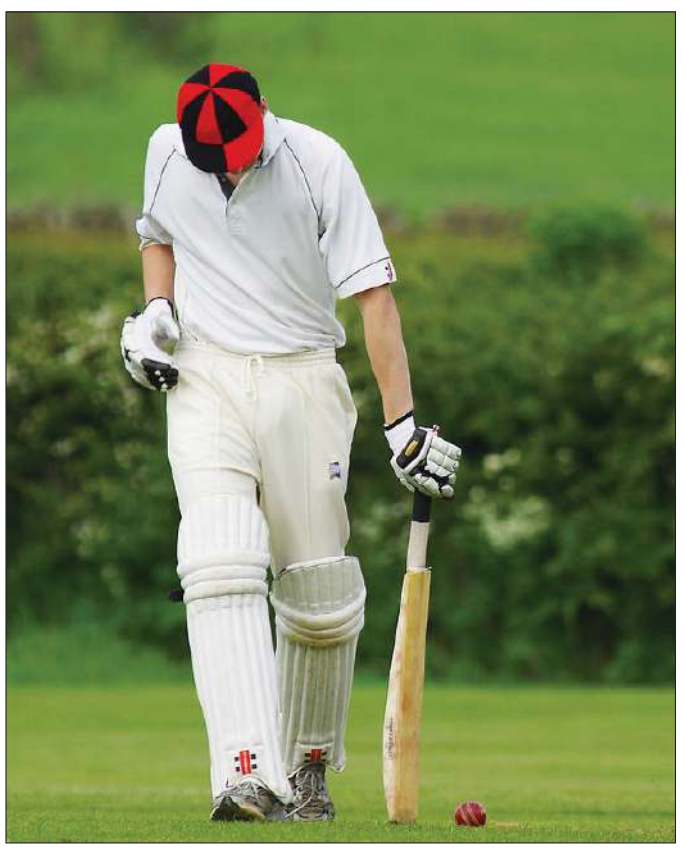
Buckinghamshire as in a for a shout for a play-off place this summer following some positive results

BUCKS are in with a great chance of reaching the National Counties Championship play-off after a convincing eight-wicket victory over Staffordshire at West Bromwich Dartmouth on Tuesday.