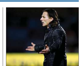
The manager was not happy