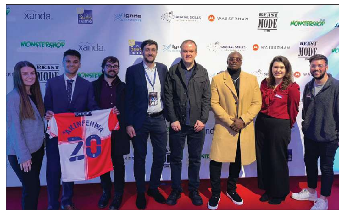
The first screening of the documentary took place on Wednesday, October 26 at the Wycombe Swan Theatre

"At some moments it was very therapeutic to look back and as an individual during my playing career, I was always asked about how many games I've played and