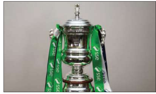
Wycombe's FA Cup dream has come to an end

A sustained period of pressure gave them hope but, just before the break Aylesford scored a fourth goal, seemly ending the tie.