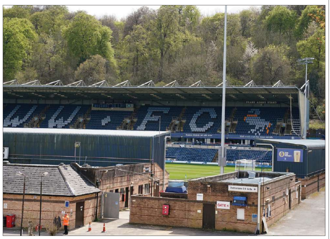
The defeat was Wycombe's second at home against Cambridge since records began. Their last loss against the Us at Adams Park was in