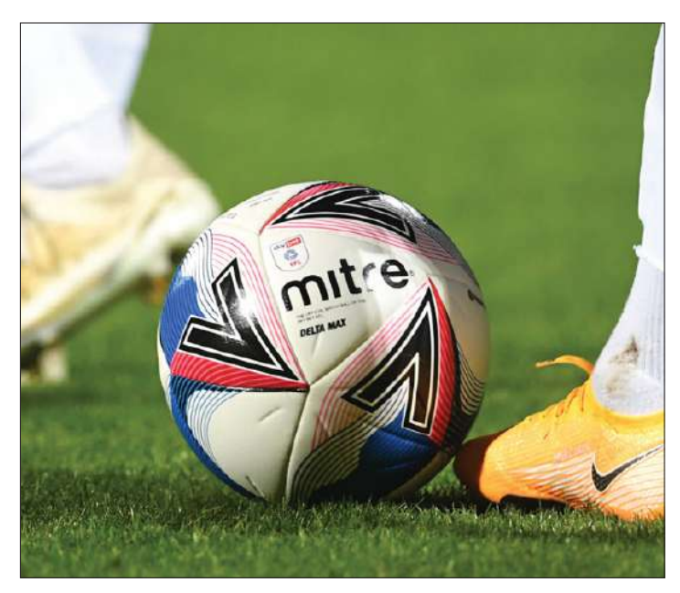
The draw is only Wanderers' third in the league this season and only the eighth since he has taken over as manager back in February