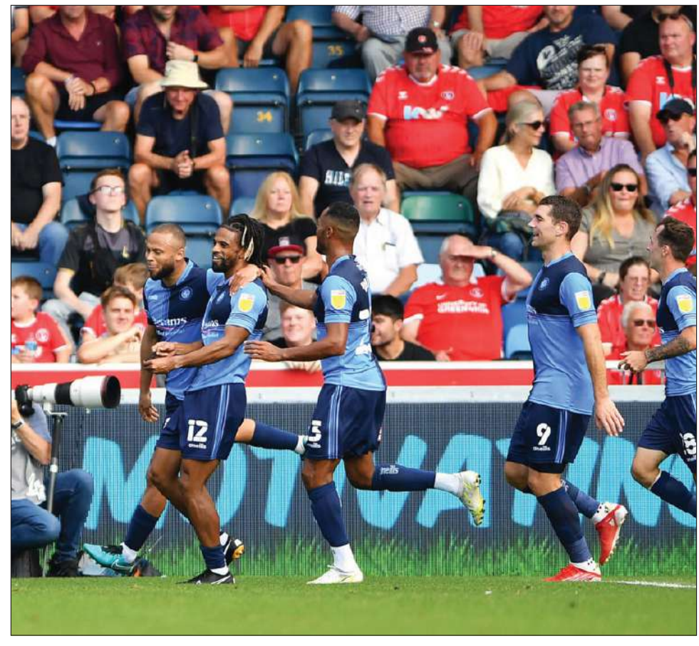
Wycombe Wanderers (pictured against Charlton Athletic in September 2021) are top of the League One table after a 3-0 win over Burton Albion

The goal was his first at Adams Park since returning to the club last season, and his first at the ground since October 2014, a total of 2,842