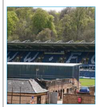
Can Wycombe win again

WYCOMBE fans are used to their team doing things the hard way, so it was no surprise that their first win of the new league season saw a nail-biting finish as 10-man Leyton Orient almost snatched a draw at Adams Park in midweek.