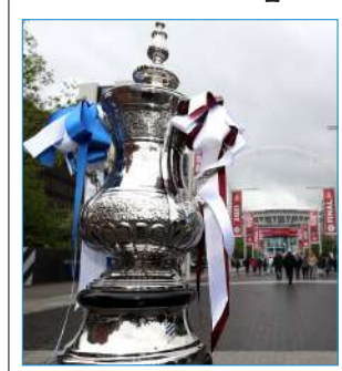
The FA Cup (PA)

WYCOMBE Wanderers have been drawn to face Hartlepool United in the FA Cup first round.