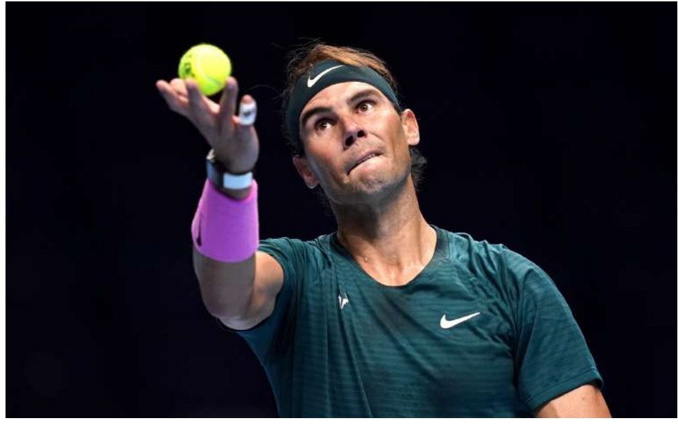
RAFAEL Nadal has tested positive for coronavirus in a development that could throw his Australian Open into doubt

"In the first innings in particular, we were a little bit short with the ball. We need to be a little bit brav-