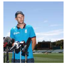
ENGLAND'S Joe Root during a press conference

JOE Root demanded his England side start learning from their mistakes if they want salvage their Ashes campaign from 2-0 down.