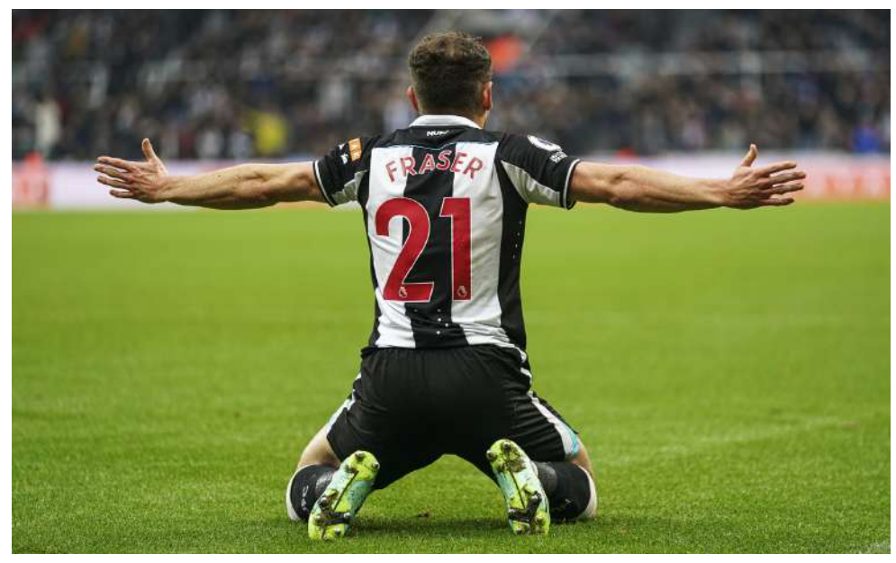
NEWCASTLE United's Ryan Fraser appeals for a penalty during the Premier League match at St. James' Park