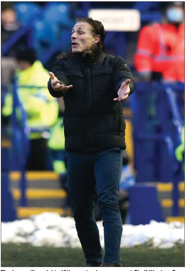
The boss will mark his 10th year in charge away at Sheff W ed on Sep 24 (Here he is pictured at Hillsborough in November 2021)