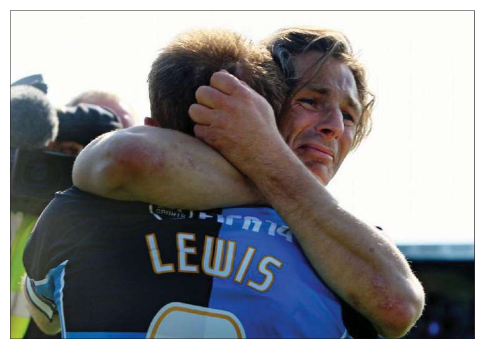
Relief. Wycombe avoid relegation in the Non League away at Torquay in May 2014