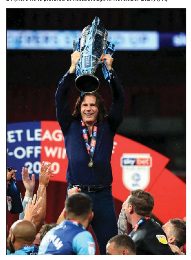
The greatest-ever day in the history of Wycombe Wanderers, as the Chairbovs gained promotion to the Championship in July 2020