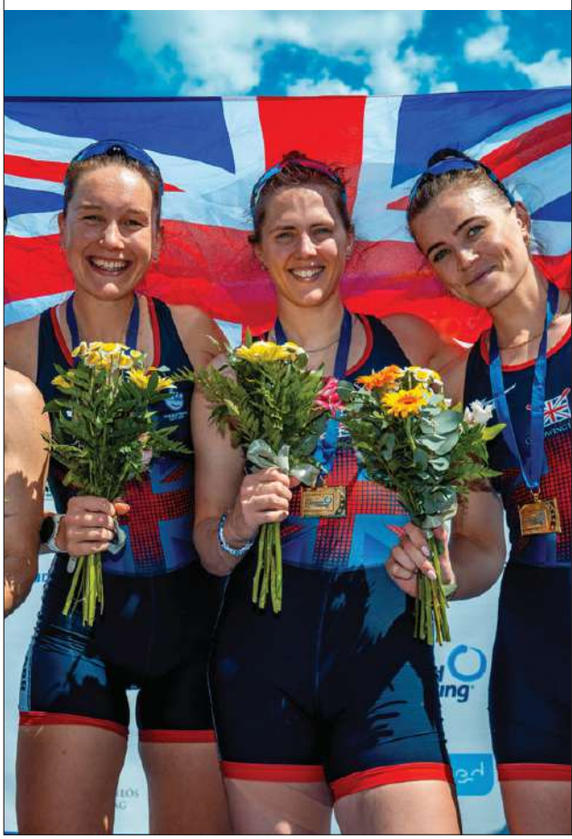
Women's four.

Glover, Bolding and the GB Rowing Team will race once more before the Olympics at the World Cup in Lucerne in May.